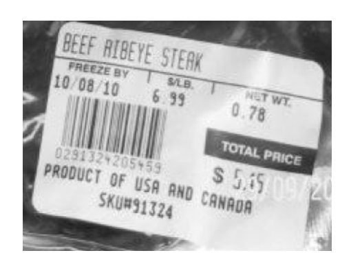
Figure 2. Samples of Label B submitted by Canada and by the United States<sup>405</sup>