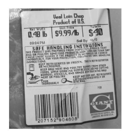
Figure 1. Samples of Label A submitted by Mexico and by the United States<sup>404</sup>

248. The Panel included in its Reports some photographs submitted by the parties showing samples of Labels A, B, and C.