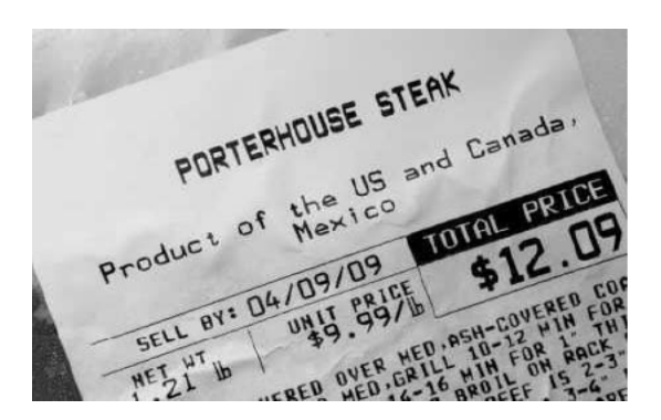
Figure 3. Sample of Label C submitted by the United States 406